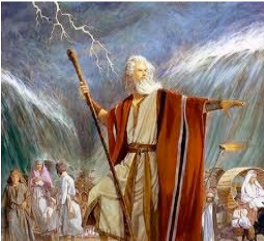
"We're headed to Jerusalem for the 60 th Annual Meeting of the Israel Heart Society!"