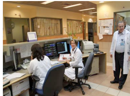
The 6-bed facility of the Intensive Coronary Care Unit

The Heart Institute is also actively involved in over 13 multinational multicenter clinical trials as well as several translational projects.