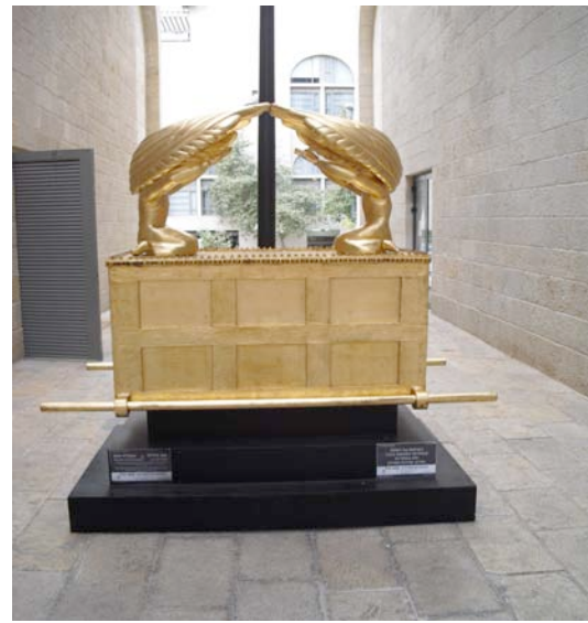
Replica of the Holy Ark in Mamilla Mall, Jerusalem